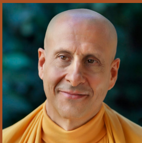
HH Radhanath Swami