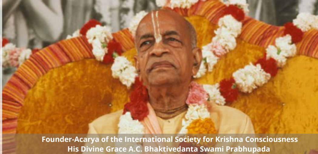
Founder-Acarya of the International Society for Krishna Consciousness His Divine Grace A.C. Bhaktivedanta Swami Prabhupada